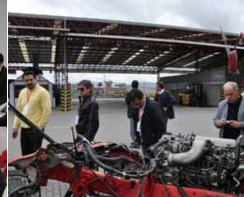
The distributors received a tour of the parts warehouse and service shops of Praco Didacol.

The "HSM Kaizen Rally 2011" in Latin America was packed with many other useful programs over the 3 days, including HMM and HML presentations on methods and actual examples for "kaizen" cases; parts sales role-playing for those in charge of parts-related business; individual meetings on quality, warranty, and product storage for those in charge of service-related business; and role-playing observation regarding service reception and new car delivery. We believe that the distributors that took part were able to take home much from this event that