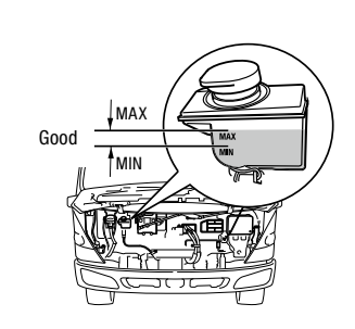
Manual Transmission Vehicle

As you know, the clutch plays a role in transmitting or cutting off motive power from the engine. The oil pressure that is generated when the driver steps on the clutch pedal is transmitted by the clutch fluid. Replacing the clutch fluid at an authorized Hino dealer must be performed every 12 months as described in your DRIVER'S/OWNER'S MANUAL. Check and make sure that the